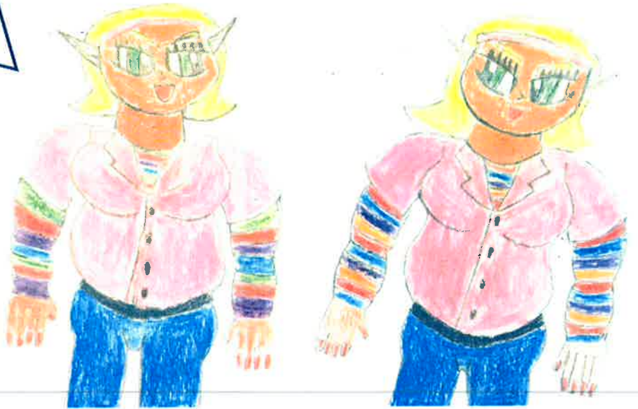
Illustration by Trevor McNamara